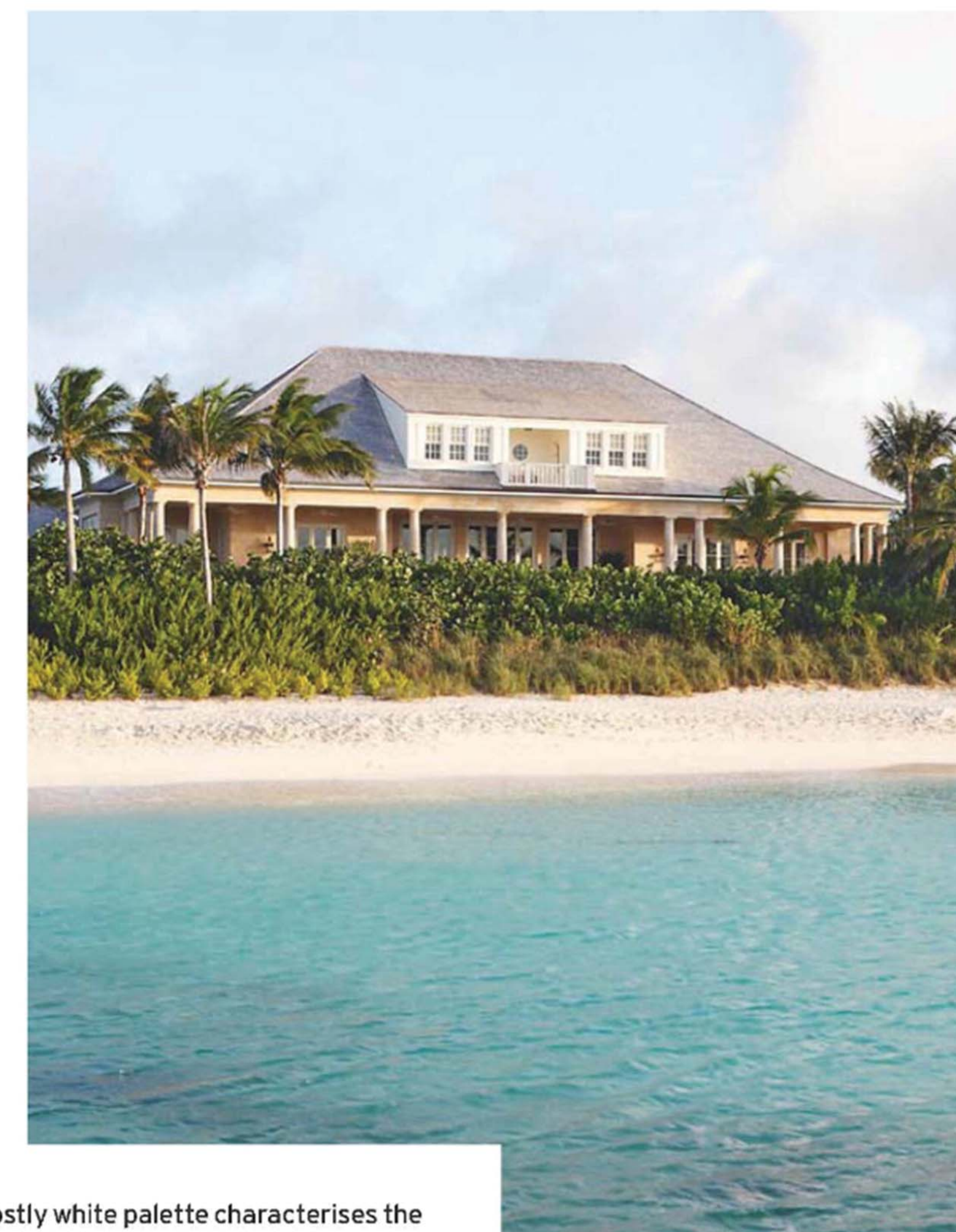
OPPOSITE ALL PICTURES A mostly white palette characterises the bedrooms, bathroom and hall, with details such as the 'Daisy' hanging light from Soane (bottom left) adding flair. THIS PAGE FROM TOP The house sits right on the beach. A pool and pool house to the side of the main house

John McCall: 01635-578007; mccalldesign.co.uk