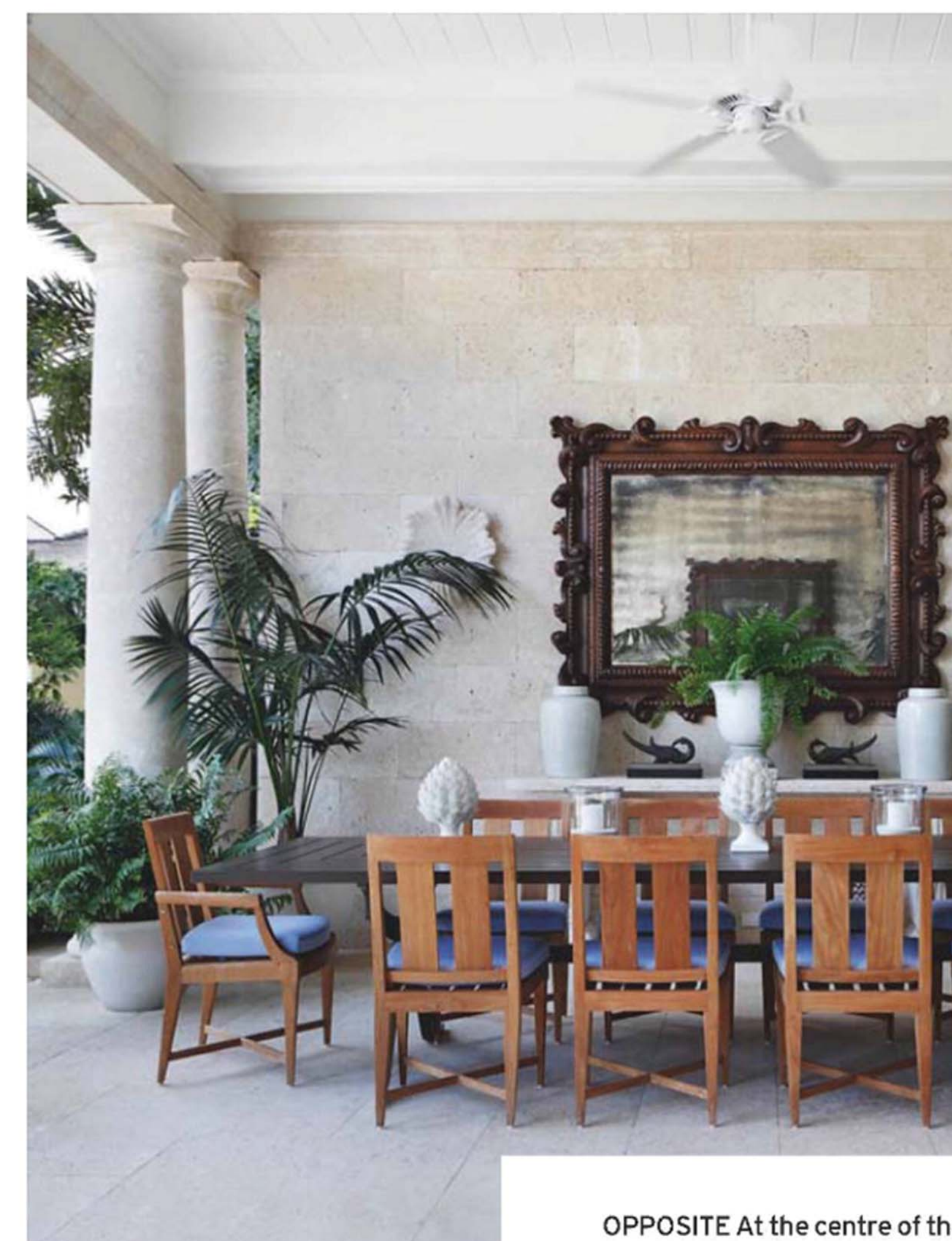
OPPOSITE At the centre of the great room, books and objets are displayed on a table from William Yeoward, sitting on a dhurrie from Guinevere. THIS PAGE FROM TOP The loggia's dining area has an acacia-framed mirror from Guinevere. A second seating area in the great room